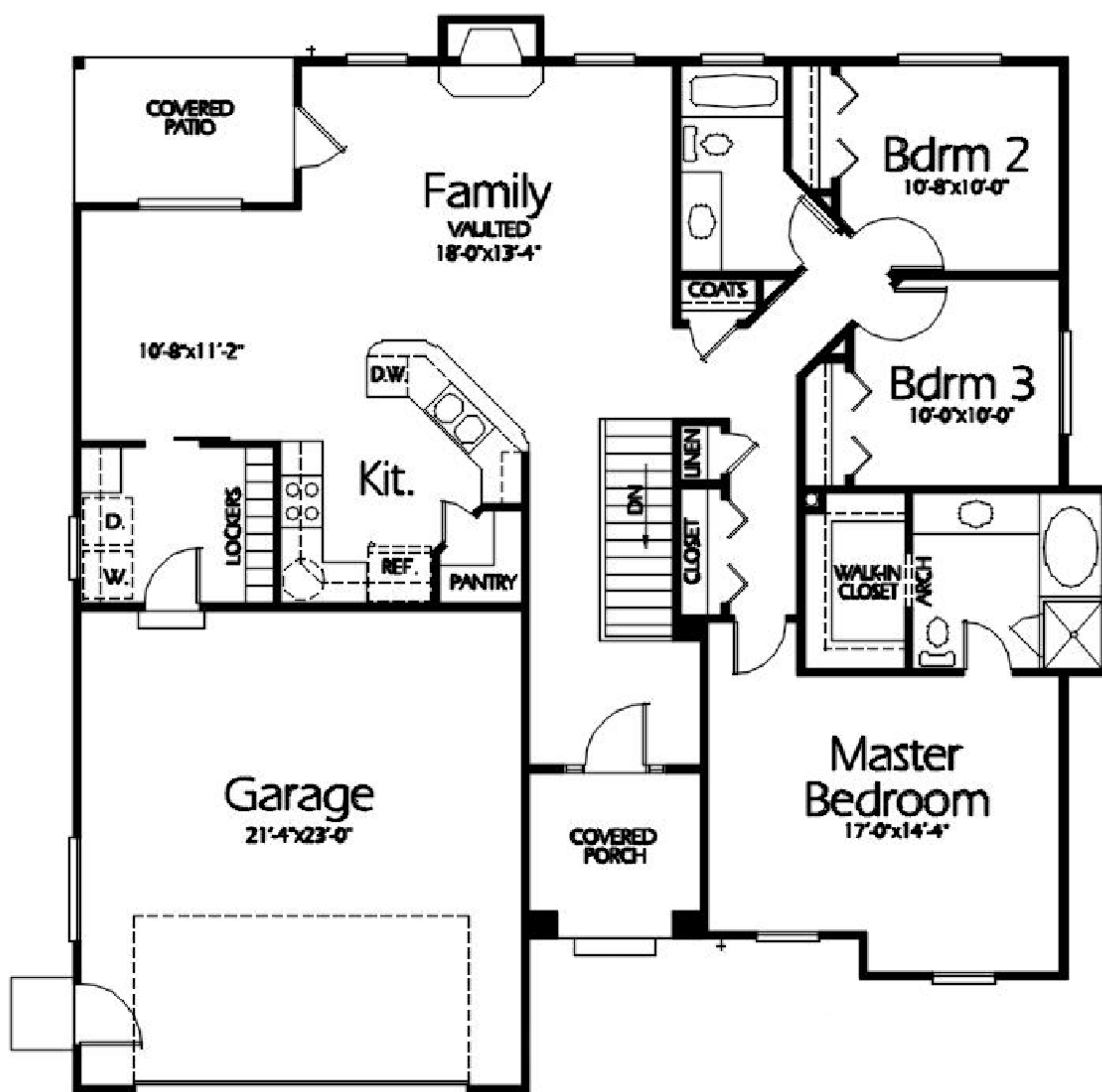
FLOOR PLAN 1 1591 SQ FT FINISHED 3223 TOTAL SQ FT

Exterior elevation & interior features listed are an artist rendering and may not represent the final standard features. See standard features list